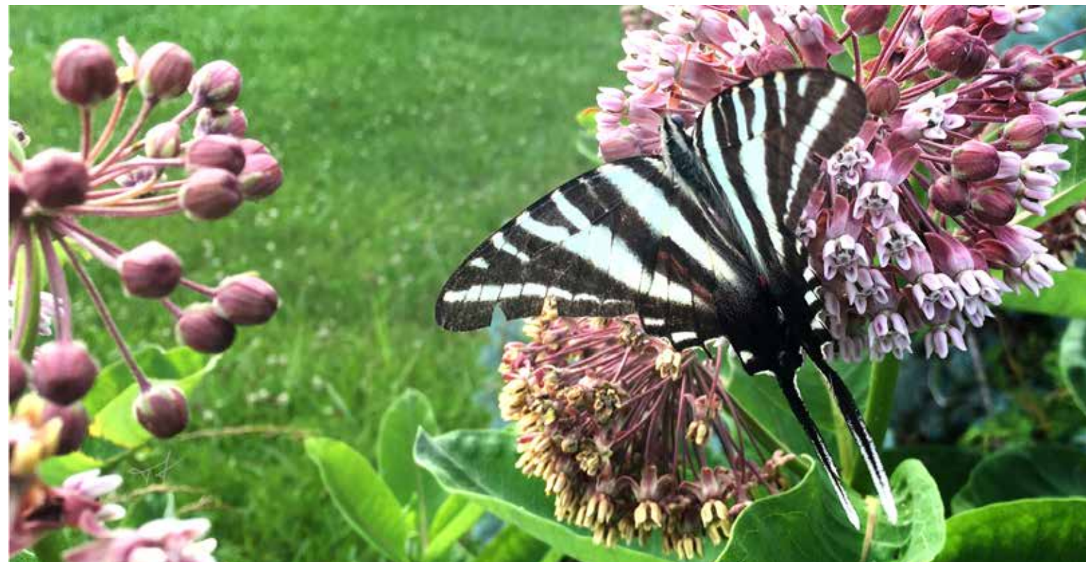
A Zebra Swallowtail butterfly feeds on milkweed flowers.