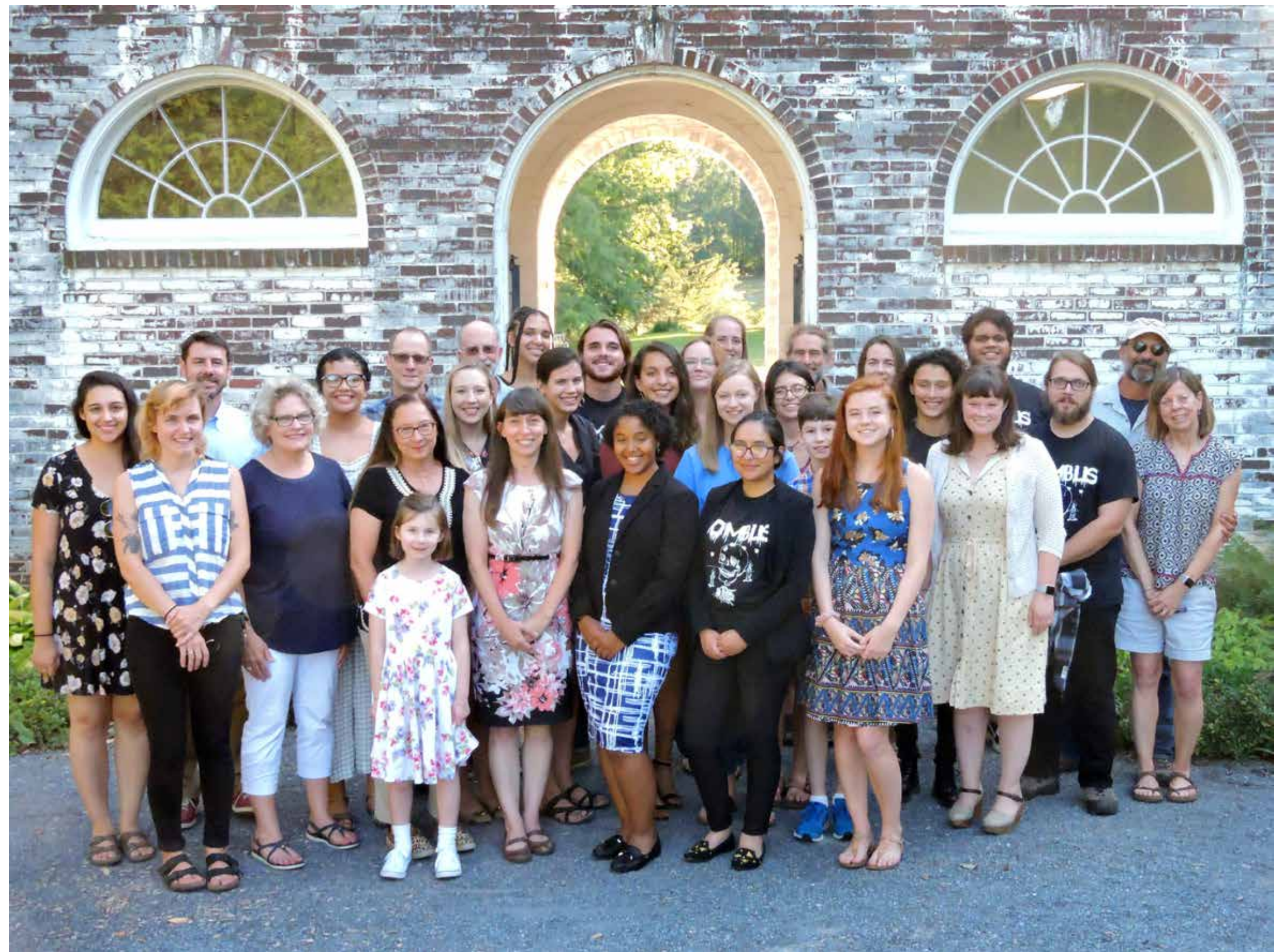
Students, faculty, and technicians pose for a photo following the 2019 Summer Research Forum.

Lutzow-Felling, Candace 2019. $113,512. Developing MWEE capacity through systemic, vertically aligned, integrated curricula, grades K-12. National Oceanic and Atmospheric Administration (NOAA) Chesapeake Bay Watershed Education and Training Program.