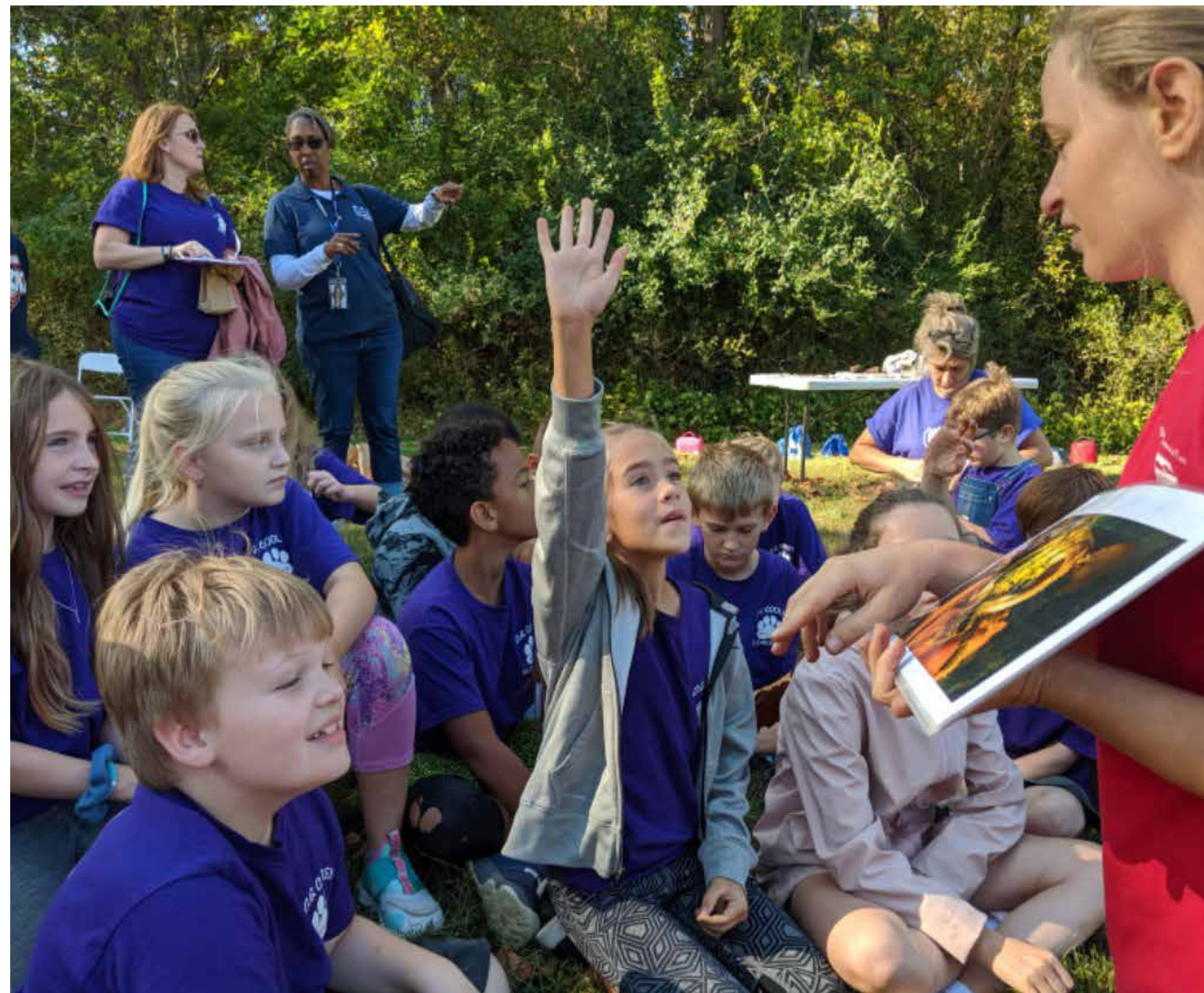
Above, Clarke County 4th grade students take part in the Conservation Fair in October 2019.