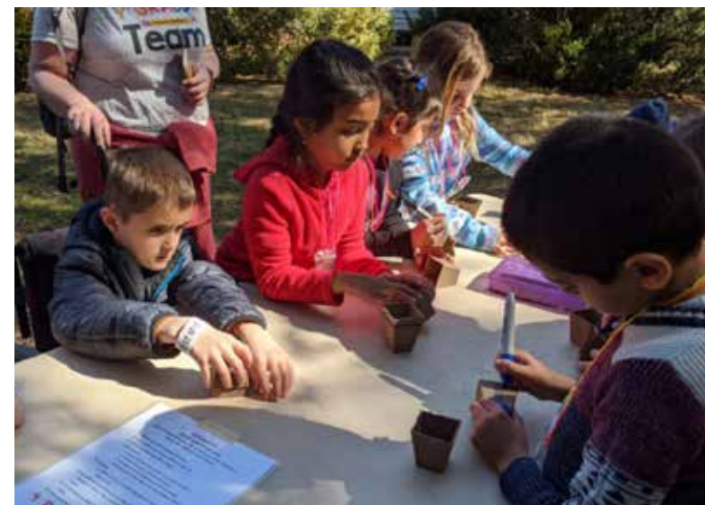
Left, prior to the cancellation of our spring programs on March 12, the entire first grade from Goshen Pass Elementary visited to learn about plants.