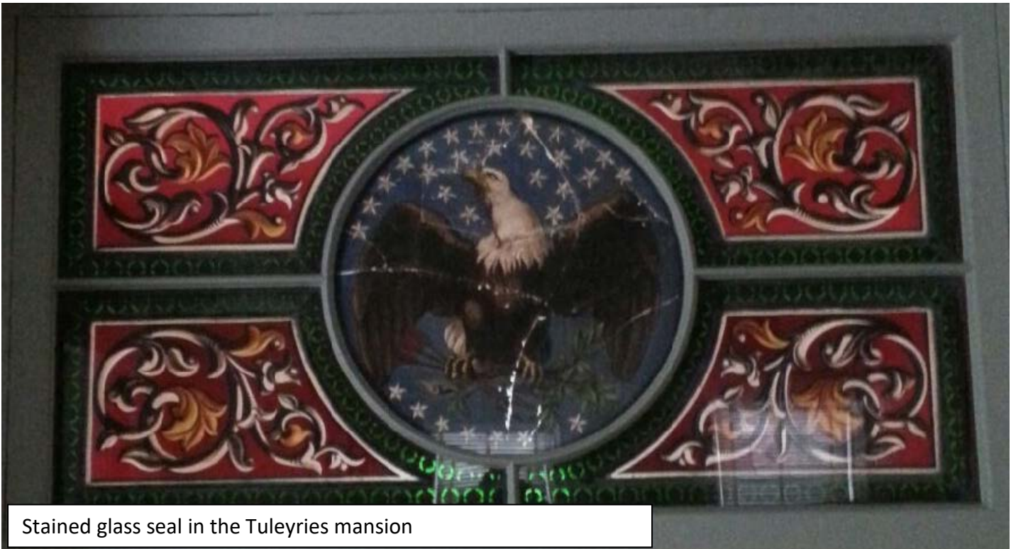
Stained glass seal in the Tuleyries mansion