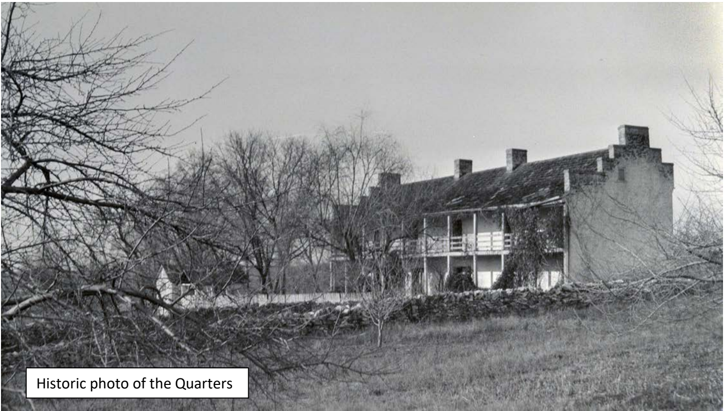
Historic photo of the Quarters