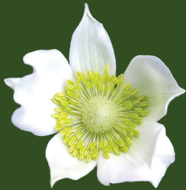
Thimbleweed - Anemone virginiana

Interspersed throughout the sometimes impenetrable wall of green are hundreds of species of wildflowers, each putting on a unique show of vivid color and form. The varied shapes and sizes of flowers reflect the varied types of pollinators active during this busy time of year.